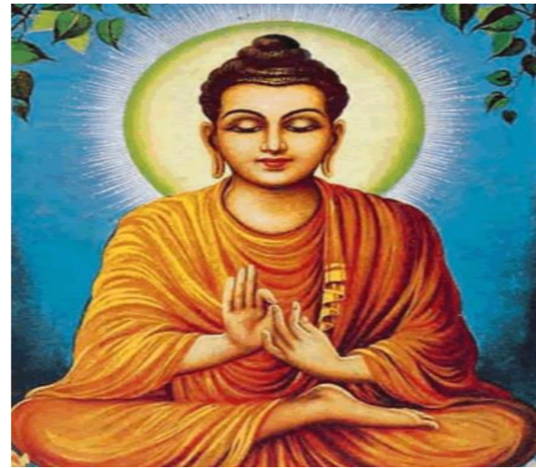
Image of the Buddha, known in life as Siddhartha Gautama, whose teachings founded Buddhism.

The holy book in Buddhism is called Tipitaka . Buddhist Temples are buildings designed for Buddhist worship.