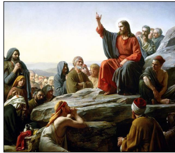
An artist's image of Jesus Christ giving the 'sermon on the mount.'

The holy book in Christianity is called the Bible . A church is a building designed for Christian worship.