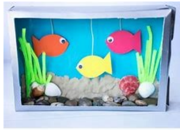
CEREAL BOX AQUARIUM thebestideasforkids.com